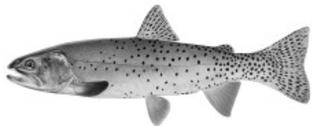
Yellowstone Cutthroat Trout

Stocked fisheries – In general these are warm and cold-water lakes and reservoirs that do not support sufficient reproduction of all the managed species to provide a fishery. These fisheries rank second only to the wild trout waters for supporting angler days. The lakes and reservoirs that top the list are Canyon Ferry Reservoir, Georgetown Lake, Ft Peck Reservoir, Hebgen and