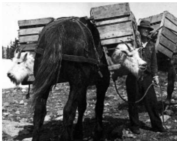
An FWP game manager transports mountain goats via horseback near Choteau, Montana, in the early 1940s.

We will maintain the long-term viability of Mon-