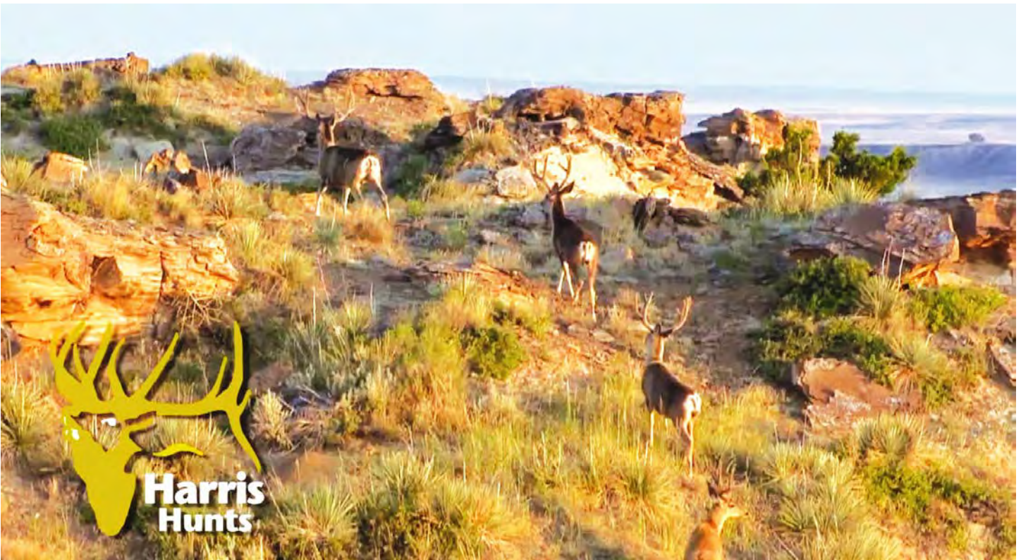
Ranch Mule Deer