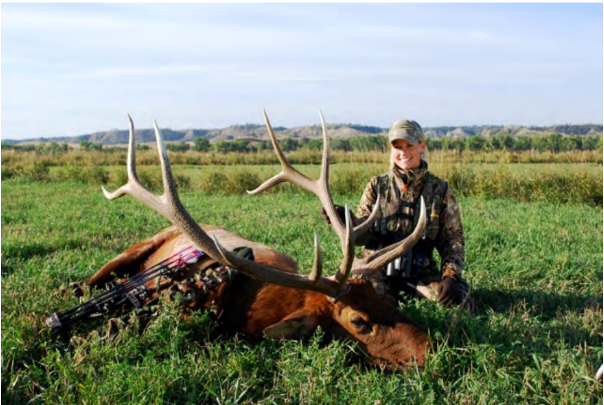
Huge 6 X 6 Bull

ACREAGE: The Harris Ranch has about 2,500 deeded acres with 330+/- acres flood irrigated from the river. There are 640 acres state of Montana lease, and about 7,250 acres of BLM. The deeded land has been plotted into about 115 tax deeds of about 20 acres each.