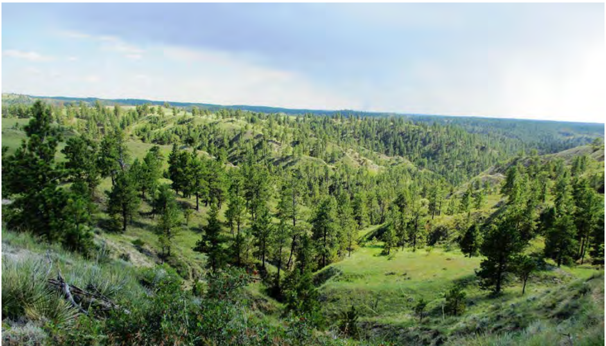
Missouri River Breaks

DESCRIPTION: The Harris Ranch nurtures a large herd of elk, deer, pheasants, and cattle in the rugged Missouri breaks, and lush irrigated hay fields along the river.