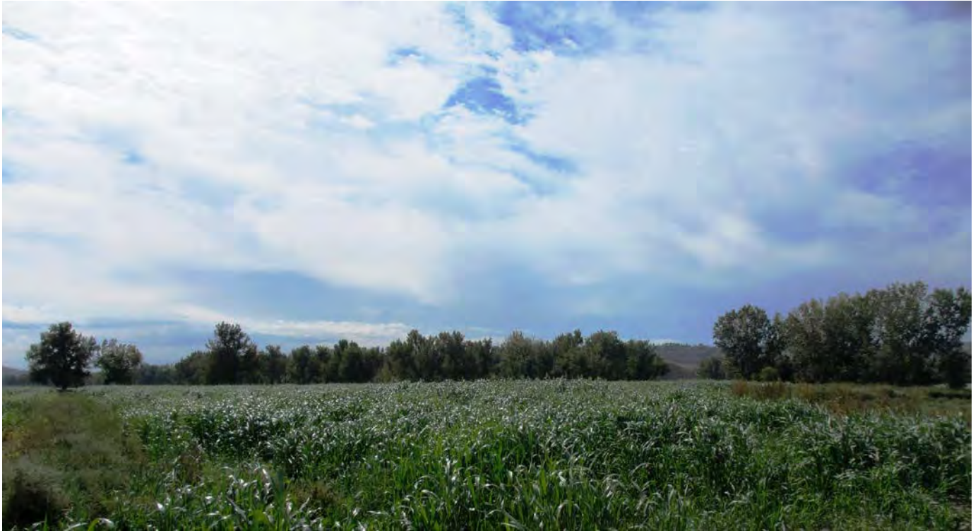
Sorghum along the River