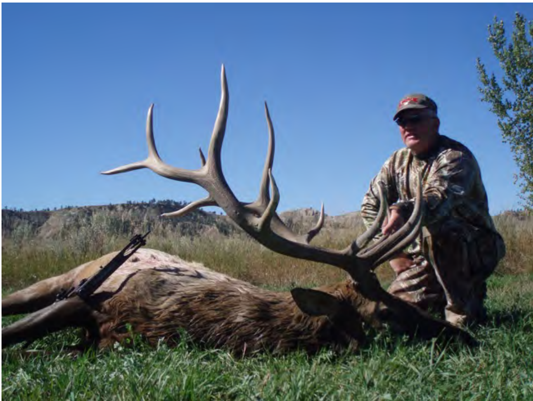
Another great Pope & Young Bull

ACREAGE: The Harris Ranch has about 2,500 deeded acres with 330+/- acres flood irrigated from the river. There are 640 acres state of Montana lease, and about 7,250 acres of BLM. The deeded land has been plotted into about 115 tax deeds of about 20 acres each.