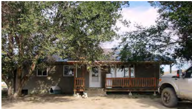
Main Home w Man's best Friends

IMPROVEMENTS: The Harris Ranch improvements are very functional. The corrals could handle 350-400 cows. Often elk watch nearby as the cowboys work the cattle.