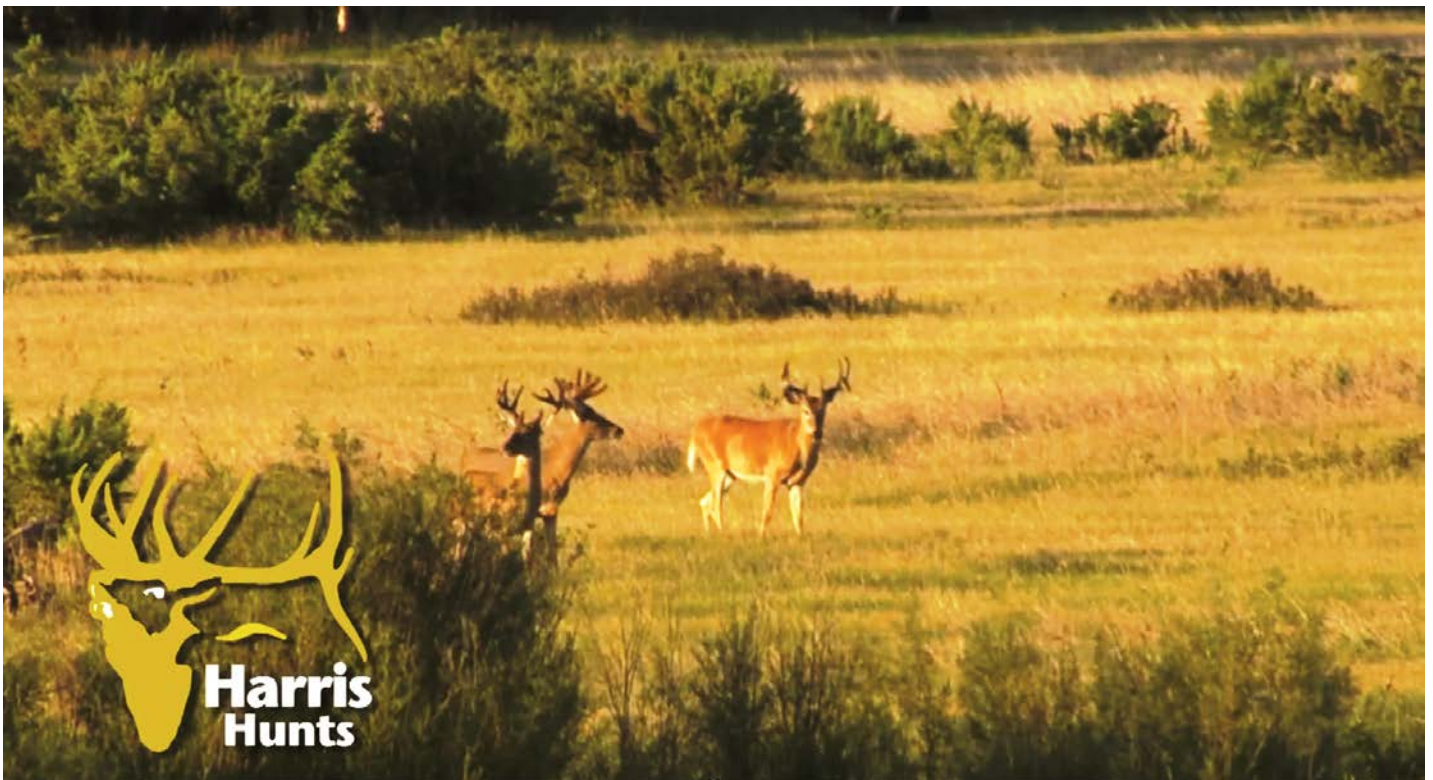
Ranch Whitetail Bucks

Disclaimer All information is from sources deemed reliable, but cannot be guaranteed as accurate. Prospective buyers are encouraged to research the information to their own satisfaction. Any offer is subject to errors, omissions, prior sale, change or withdrawal without notice, and approval of seller. Water rights are subject to the Montana Water Court.