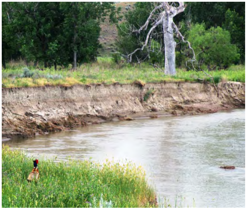
Rooster along the River

There are NO easements on the ranch. Foundations are interested in a conservation easement, which could save a million dollars or more in taxes.