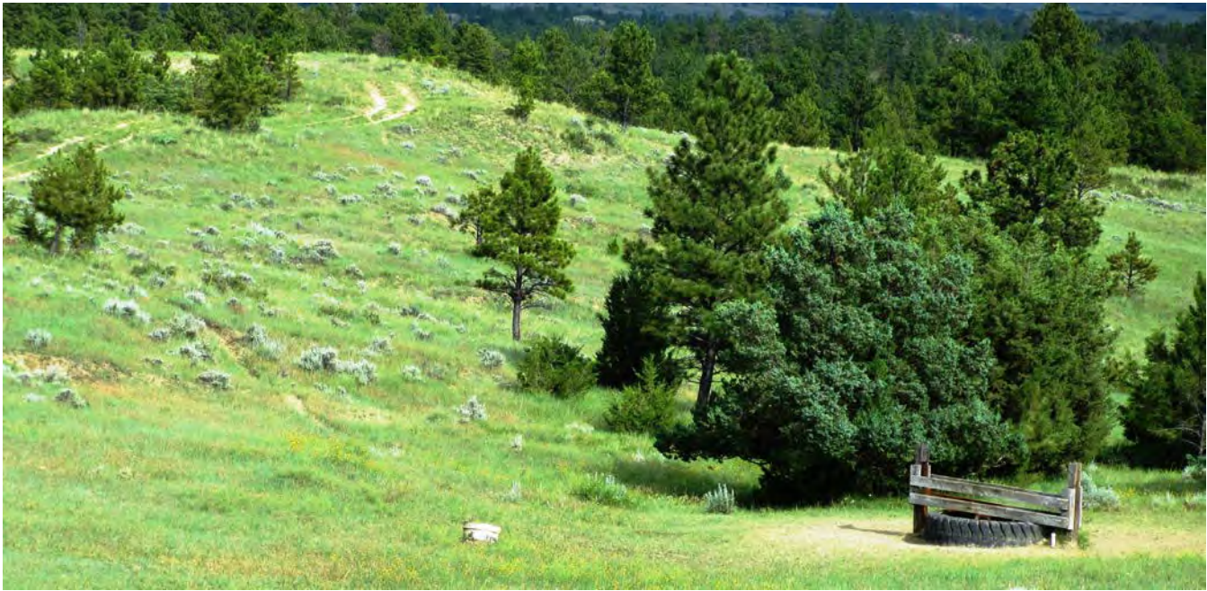
Tank on Pipeline on Deeded Land

A well supplies the 8-10 tanks on the stock water pipeline that extends from the well on the northwest to the border on the south east corner of the ranch. The wells and tanks are all on deeded land. There is a large storage tank at the highest point on the pipeline.