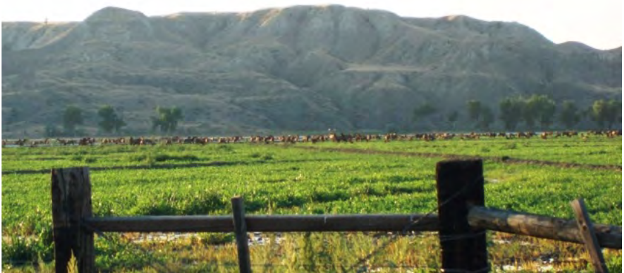
Elk during the Rut

Without baiting or fences, HUNDREDS of elk freely rut on the Harris Ranch. Although public land is very close, almost no bull elk have ever been killed on the neighboring public lands. Elk know where they feel safe and are not harassed.