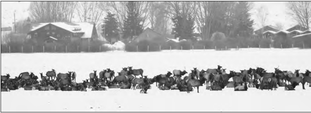
Figure 2. Elk on the National Elk Refuge, Jackson, Wyoming.

in free-ranging elk and bison, and, occasionally, it spills over into cattle (Wyoming Game and Fish Department 2004, Maichak et al. 2009).