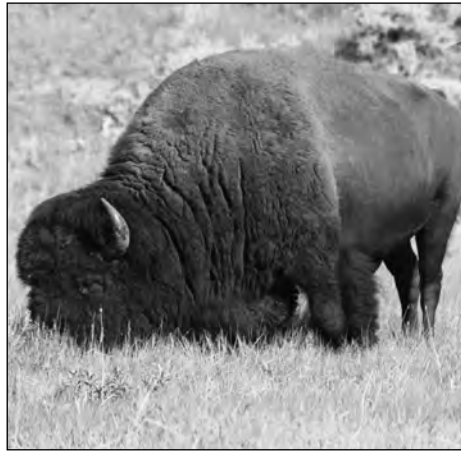
Figure 3. Brucellosis was first observed in Greater Yellowstone area bison in 1917.

In lieu of effective vaccines for wild ungulates, WGFD has undertaken several other brucellosis management activities, including an experimental test-and-slaughter program. The pilot program, which was initiated in 2006 and concluded in 2010, involved trapping elk on selected feedgrounds, testing for antibodies against B. abortus , and culling females that tested seropositive. Tissue samples from culled elk were then sampled to determine whether seropositive individuals were actively infected with B. abortus . The program's goals were to improve methods of detecting and preventing infections in elk, reduce seroprevalence by removing affected animals, and offer insights for vaccine development. The preliminary results of this pilot program indicate a decrease in brucellosis seroprevalence in captured elk on select feedgrounds (Fenichel et al. 2010). However, its social and economic costs limit its suitability for use at a regional level or over a sustained period.