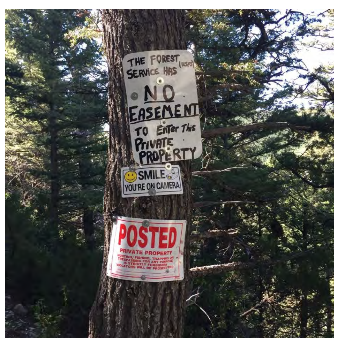
Signs posted by landowners where disputed Trail 136 crosses a private ranch in the east Crazies on its way to public lands. Advocates say the trail appears on forest maps at least as far back as the 1930s.

and instead call it a trampling of their property rights.